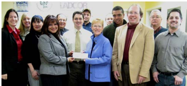
Supporting non-profit Chamber member Albany Park Community Center.

Our boundaries: Cicero Avenue on the West to the North Shore Channel on the East, Foster Avenue on the north to Montrose Avenue on the south.